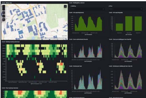
Figure 2. Elastic WiFiMon Kibana main dashboard

Elasticsearch is not a typical SQL database, instead it stores data as JSON documents which is great to store unstructured data but makes some common tasks such as join operations with structured data a little bit harder to achieve. Therefore, some information has to be duplicated at load time to make it easier to aggregate later on. As such we have created ingest pipelines that merge information such as AP location in buildings and floors as well as maximum building occupancy data, with data from the log files. We also track session information (start, duration and end time between association and disassociation of each MAC address at each AP) on the fly in a Logstash aggregator, so that data becomes readily available in each JSON document and can be aggregated and queried directly by Kibana visualizers to be displayed in dashboards (see Figure 2).